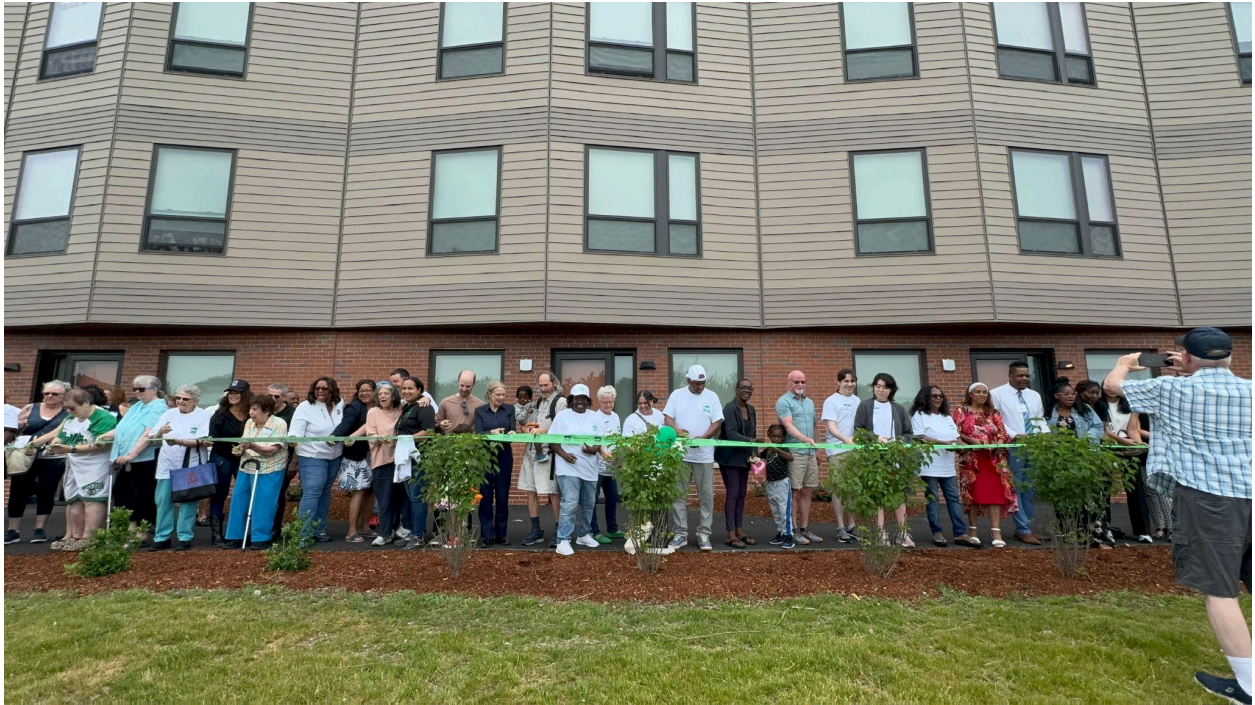
Community Members and residents cutting the One Halleck St ribbon!