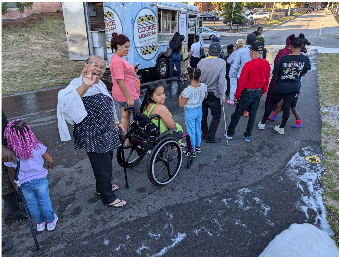
Residents lined up to get some ice cream from the Cookie Monstah, provided by Maloney Properties